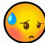
( angry - embarrassed )