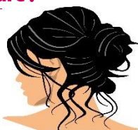
(hairpin - hairstyle)