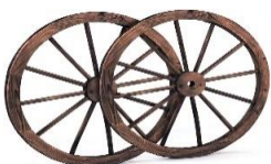
(Wheel - well)